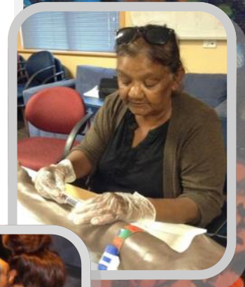
Above: Students practicing during pathology unit