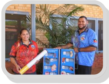
TTA Project Officers delivering a smoking prevention workshop

Transition to Adulthood is a youth program that delivers healthy lifestyle activities and workshops on topics such as drug, alcohol and tobacco education and prevention, sexual health education, resilience and career